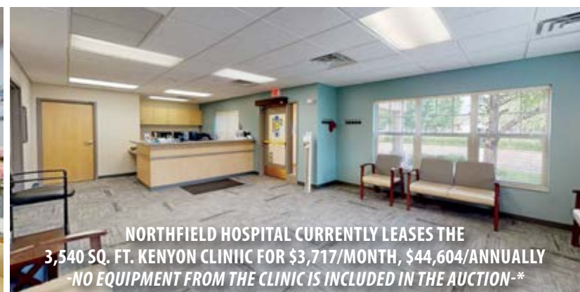
NORTHFIELD HOSPITAL CURRENTLY LEASES THE 3,540 SQ. FT. KENYON CLINIC FOR $3,717/MONTH, $44,604/ANNUALLY -NO EQUIPMENT FROM THE CLINIC IS INCLUDED IN THE AUCTION-*