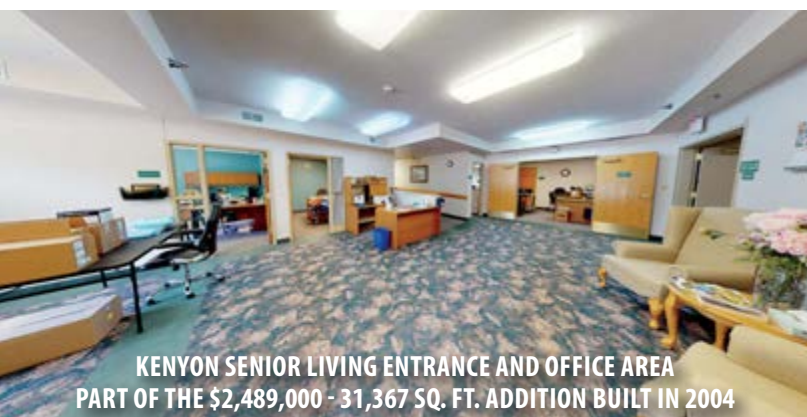
KENYON SENIOR LIVING ENTRANCE AND OFFICE AREA PART OF THE $2,489,000 - 31,367 SQ. FT. ADDITION BUILT IN 2004