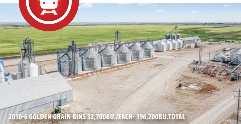
2010-6 GOLDEN GRAIN BINS 32,700BU./EACH- 196,200BU.TOTAL