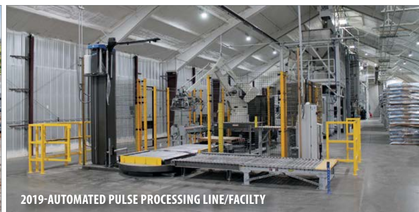
2019-AUTOMATED PULSE PROCESSING LINE/FACILITY