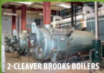
2-CLEAVER BROOKS BOILERS