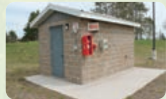
TRACT 8: RETAIL FUEL STATION-2751 MIDWAY ROAD, DULUTH, MN-EQUIPMENT PACKAGE AND/OR .89± ACRES REAL ESTATE*