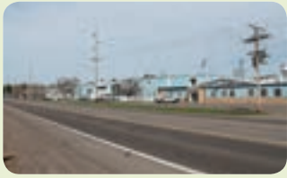
TRACT 1: 72,325 SQ. FT. HEAVY MANUFACTURING/WAREHOUSE BUILDING ON 3.52± ACRES