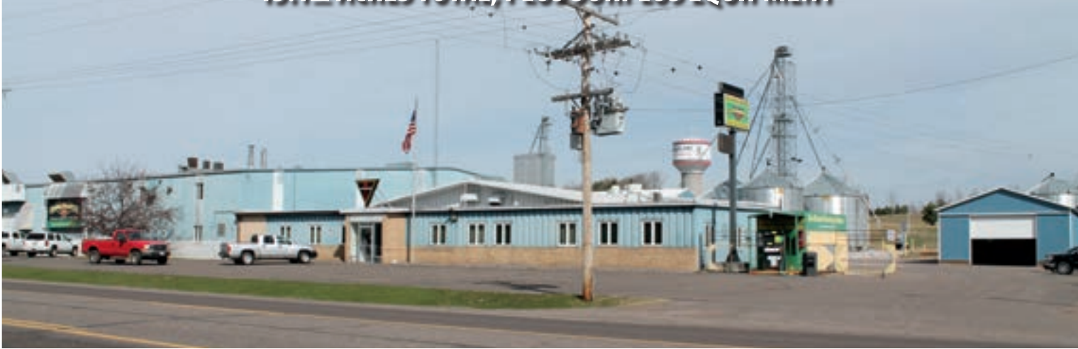
TRACT 5: 3 MGY BIODIESEL EQUIPMENT PACKAGE

3-MGY BIODIESEL PLANT, 2-OILSEED PROCESSING FACILITIES, $1.1 MILLION DOLLAR 171,000 BUSHEL GRAIN HANDLING FACILITY, 72,325 SQ. FT. MANUFACTURING / WAREHOUSE FACILITY, 2-RETAIL FUEL STATIONS, 13.1± ACRES TOTAL, PLUS SURPLUS EQUIPMENT