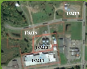
TRACT 7 TRACT 9 TRACT 2 TRACT 1