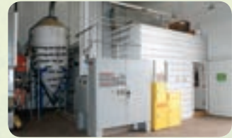
TRACT 4: SMALLER 1.75 MILLION BUSHEL/YEAR OILSEED CRUSHING FACILITY EQUIPMENT PACKAGE