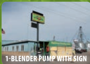
1-BLENDER PUMP WITH SIGN