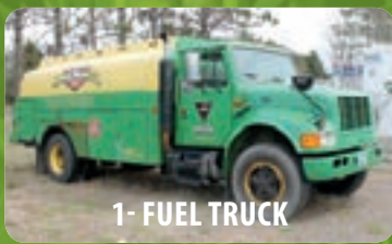
1- FUEL TRUCK