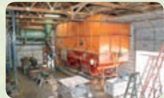
TRACT 5: 3 MILLION GALLON/YEAR BIODIESEL B100 PLANT EQUIPMENT PACKAGE • TRACT 6: BIODIESEL LAB EQUIPMENT PACKAGE