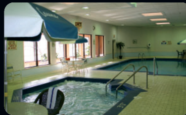
Indoor Pool Area