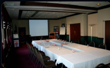
6,500 Sq. Ft. of Meeting Rooms