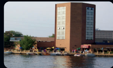
River Front Location

179 ROOM FULL SERVICE HOTEL ADJACENT TO CONVENTION CENTER OSHKOSH, WISCONSIN THURSDAY, MAY 14 AT 11:00 AM