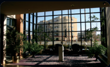
Two Story Atrium