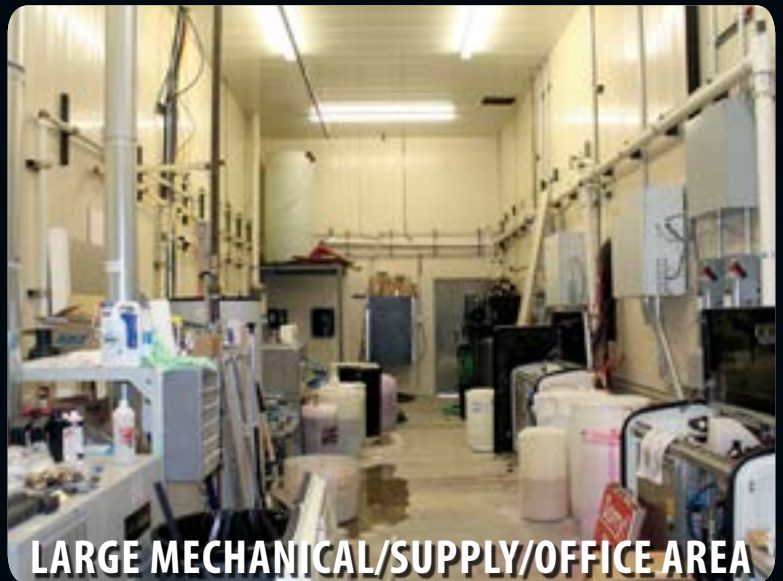
LARGE MECHANICAL/SUPPLY/OFFICE AREA

BROKER PARTICIPATION: Broker Participation is welcome but not required. A 2% commission will be paid to the licensed broker who at the time of registration, registers the bidder who pays for and settles for the real estate. A broker buying on his/her behalf, or on behalf of any business entity in which he/she holds an interest, is not entitled to a commission.